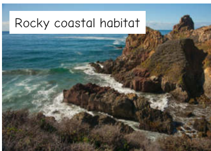
Rocky coastal habitat